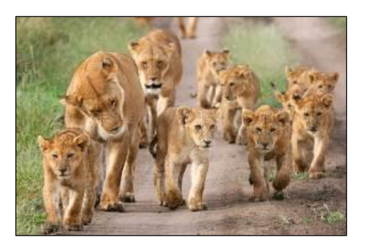
<u>Day 6</u> Breakfast, Lunch & Dinner

Good morning South Africa! Today we will rise with the sun, have breakfast and head to a Community Service Project where we will be involved with assisting local communities in need. Today's focus is to give something back to the communities in which we have visited.